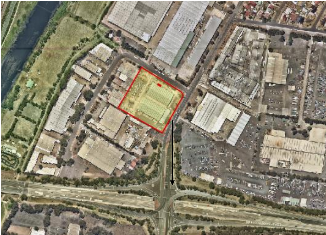
Figure 1 – Aerial photograph of subject site