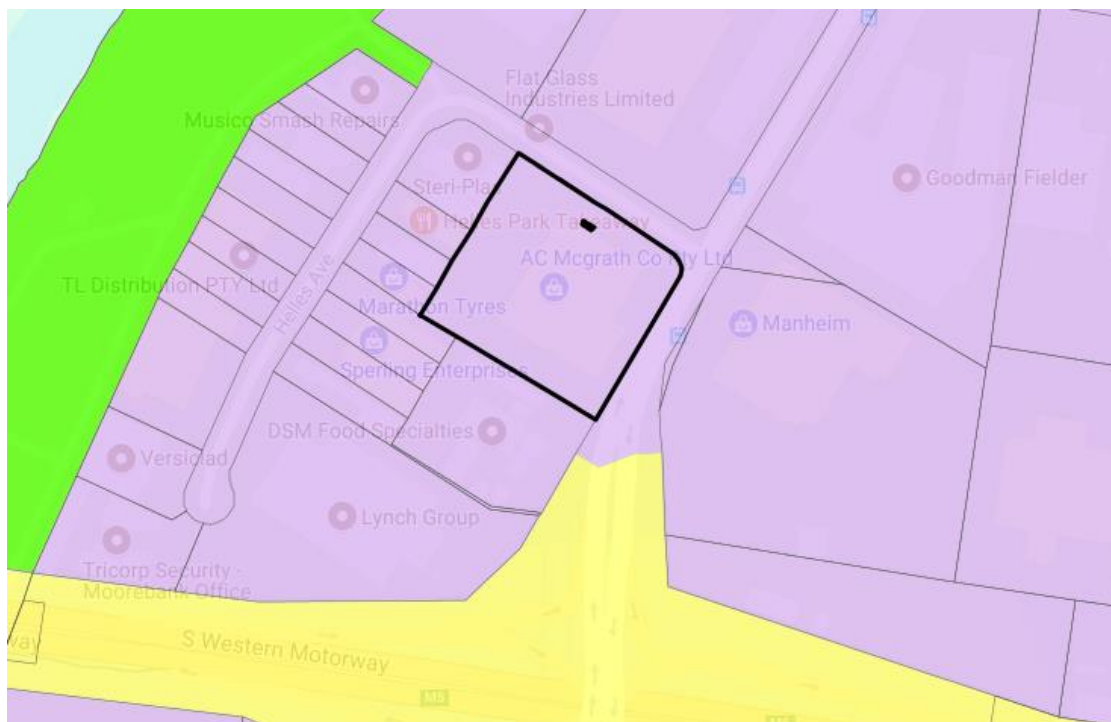
Figure 2 – Extract of LLEP 2008 zoning map

The site is zoned IN1 – General Industrial. An extract of the zoning map is provided below.